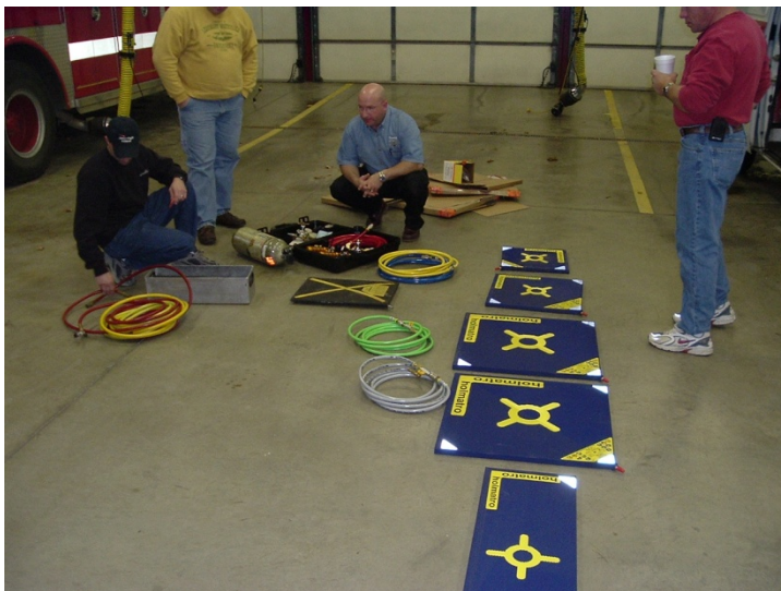
Hamilton firefighters receive instruction on high pressure air bags during a Wednesday night local training drill at the fire station.

many of the firefighters seek out more specialized training opportunities offered by state fire instructors and other fire service experts. Our certified personnel are well trained and possess a vast amount of emergency service experience. These volunteers are the most important asset we have. Personnel are well equipped and ready to perform in order to serve the community during emergency incidents. In total, Hamilton Fire Department personnel logged an impressive 2587 hours of training in 2009. On average, that is about 75 hours per firefighter!